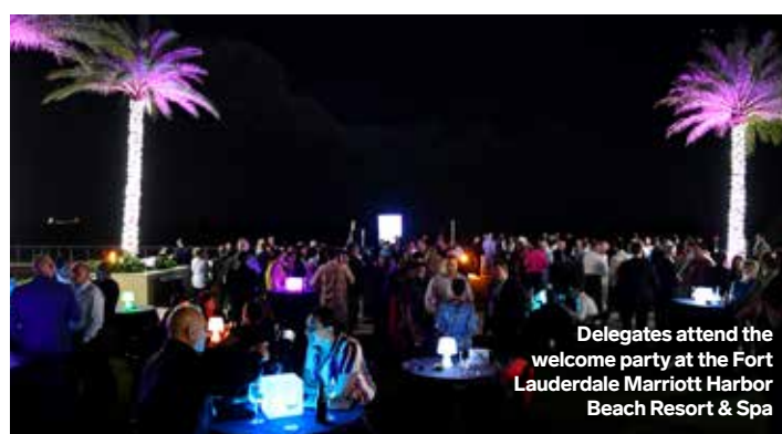
Delegates attend the welcome party at the Fort Lauderdale Marriott Harbor Beach Resort & Spa

“It is a well-known fact that the Americas is rich in sporting tradition and passion, and now is the time to open new frontiers and look beyond