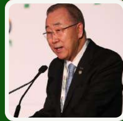
Ban Ki-Moon United Nations