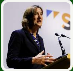
Katherine Grainger