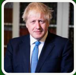
Boris Johnson United Kingdom Government