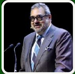
Yannis Exarchos OBS, Olympic Channel