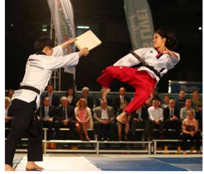
SportAccord 2019 in Gold Coast offered delegates a host of entertainment and networking opportunities. The Opening and Closing events focused on the local Australian culture. Sport was celebrated in a range of daily activities and the United Through Sports Festival.