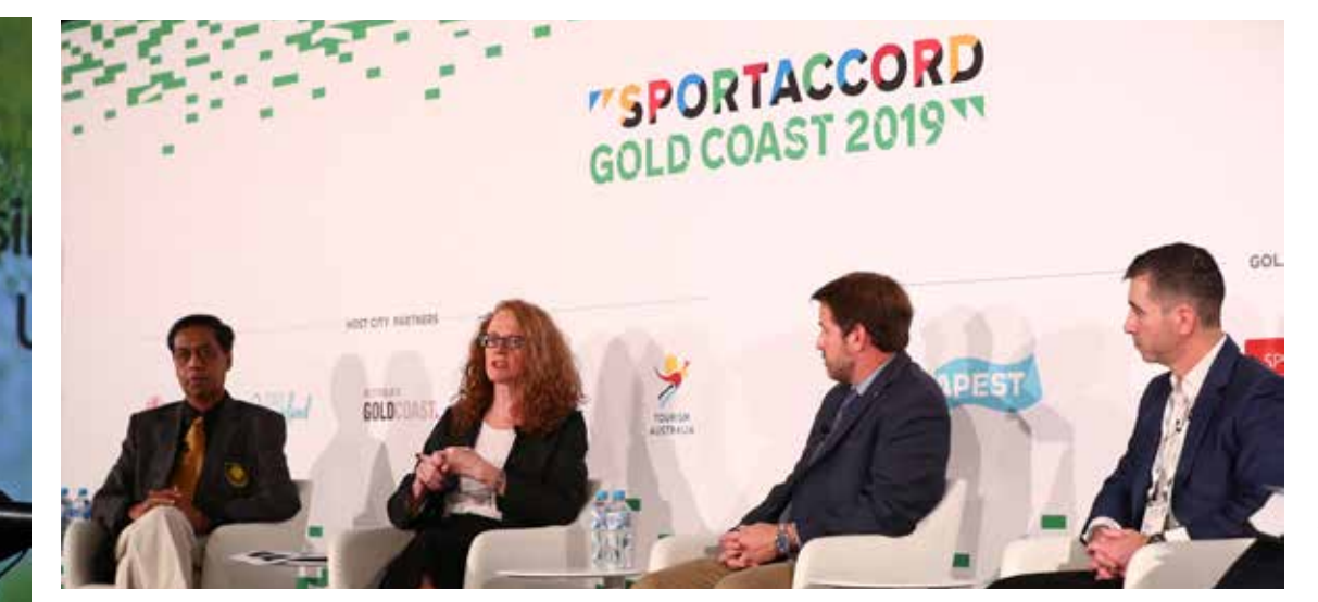
Thought leaders and senior figures from the sports world were among the speakers and panellists for the Conference programme. The SportAccord Summit included a new Hub in pop-up style rooms, while the expanded LawAccord packed the auditorium. CityAccord, HealthAccord and MediaAccord again offered insight to delegates from across the sports ecosystem.