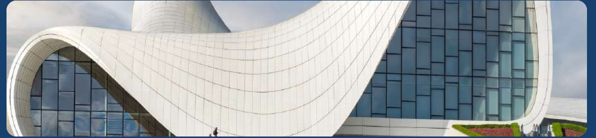
Heydar Aliyev Center

The SportAccord 2026 Opening Ceremony will take place in this global architectural landmark, designed by Zaha Hadid.