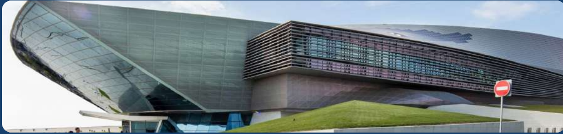
Baku Convention Center

A striking, state-of-the-art venue offering: